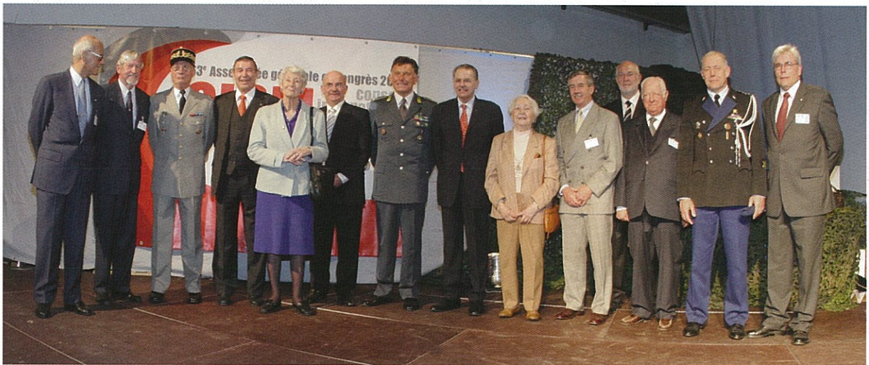
Past Presidents, Secretaries General and other historical men and women of CISM