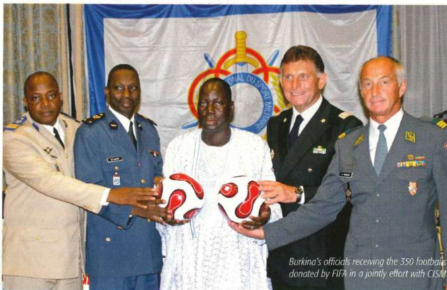
Burkina's officials receiving the 350 footballs donated by FIFA in a jointly effort with CISM