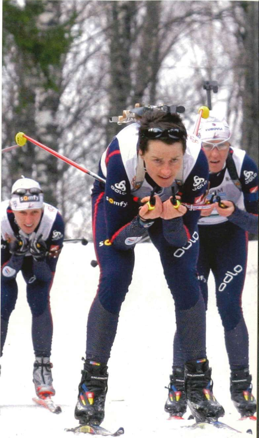
French women patrol team