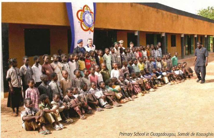
Primary School in Ouagadougou, Somdé de Kossoghin