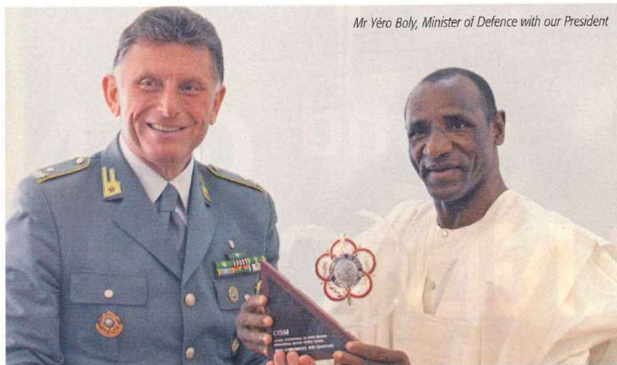
Mr Yéro Boly, Minister of Defence with our President

Ouagadougou, capital city of Burkina Faso, hosted the 62 nd CISM General Assembly and Congress. At the heart of Western Africa, "The Country of Honest Men" showed great mastery in managing preparations for this most momentous event.