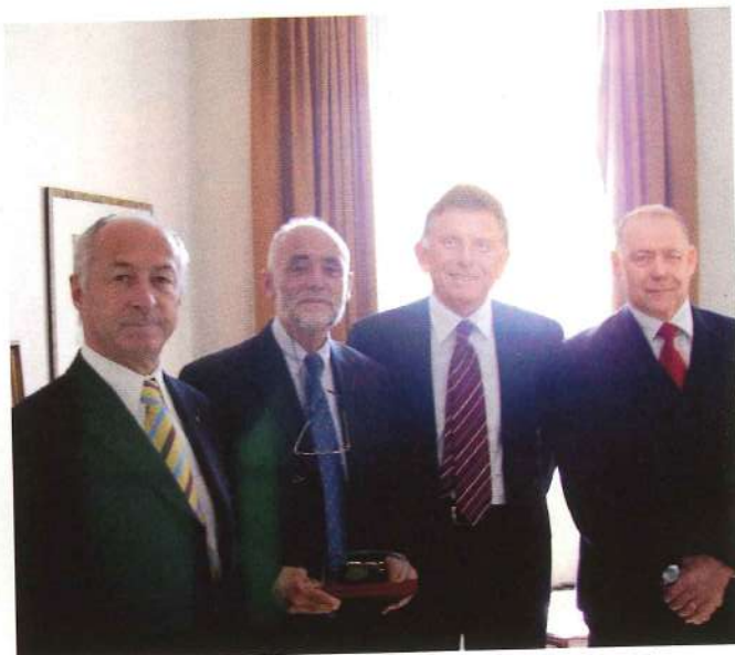
ICRC President, Dr Jakob KELLENBERGER (2nd left) flanked by the CISM officials

On 30 th March, meeting with Dr Adolf OGI, Deputy Secretary General of the United Nations and Special Advisor of the United Nations's Secretary General on Sport for Development and Peace.