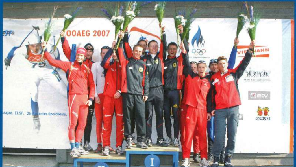
Podium patrol race men